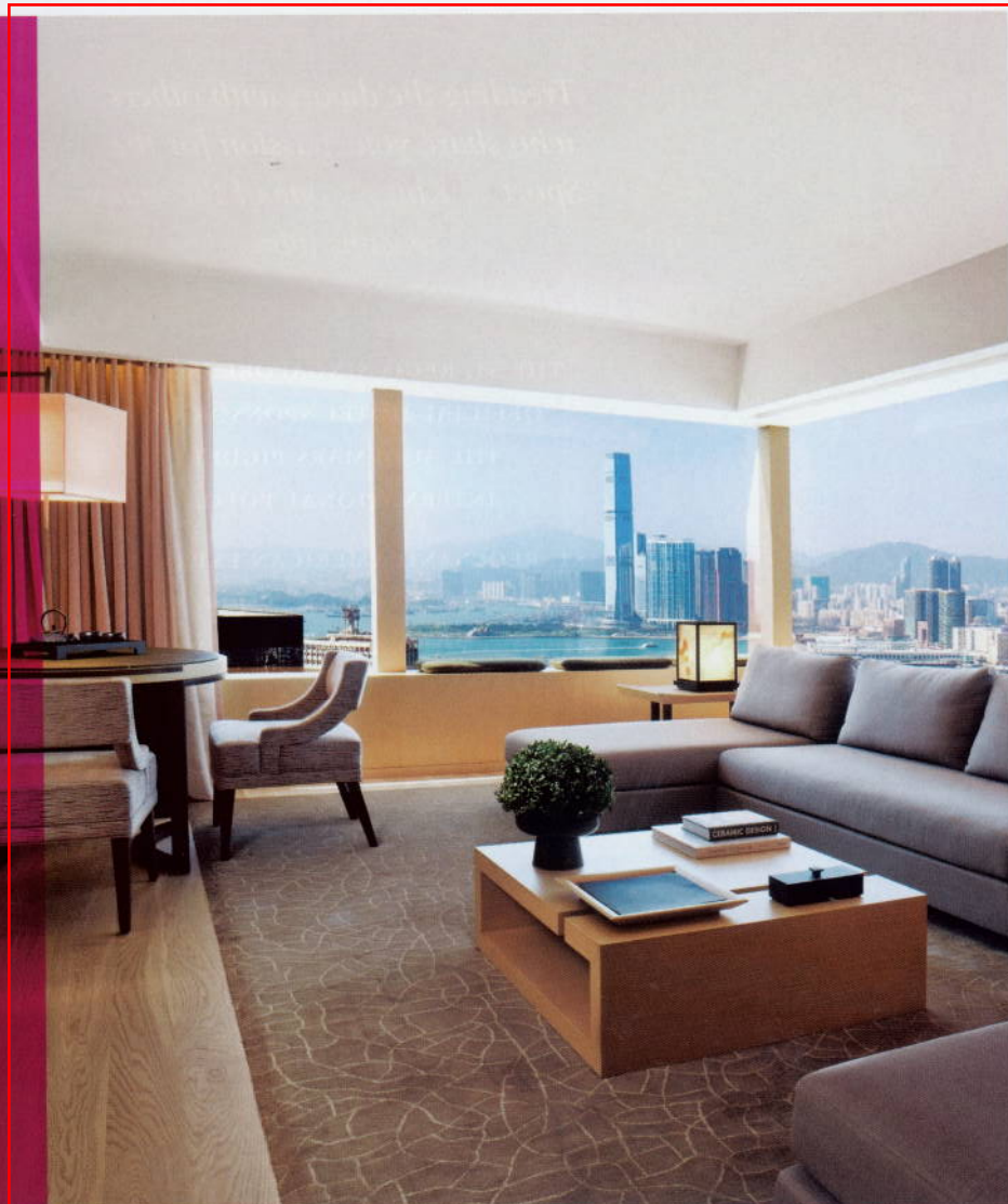
An Upper Suite living room at the Upper House in Hong Kong, left. Opposite: The pool view at Alifas Villas Uluwatu on the south coast of Bali.

More pied-à-terre than hotel, this contemporary-style 117-room property in a Central tower is all about subtle details. Although the look is minimalist, there's nothing pared-down about the quality of the materials or the size of the rooms—the smallest is 69 square meters. There are limestone-covered bathrooms (beware of the toe-trapping floating steps leading up to the tub), shoji glass, glistening pale wood surfaces and lacquered paper panels. All this, and a restaurant by star chef Gray Kunz, formerly of the St. Regis and Café Gray in New York. 88 Queensway; 852/2918-1838; upperhouse.com; doubles from HK$2,996. »