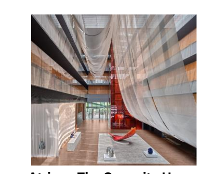
Atrium, The Opposite House