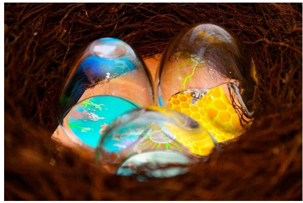
L6, The Upper House