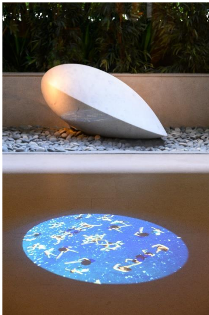
L6, The Upper House