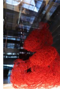
The Invisible Vein “Evolutionism”