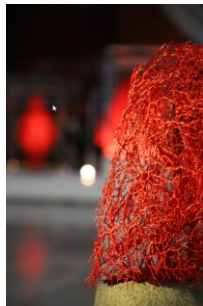
The Invisible Vein “One Stone, One World”