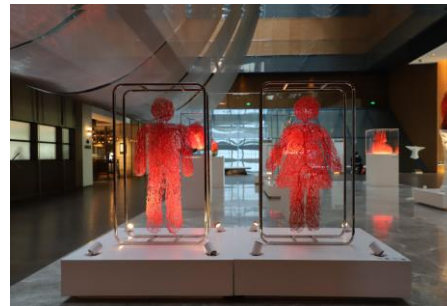
The Invisible Vein “Ultimate Loneliness”