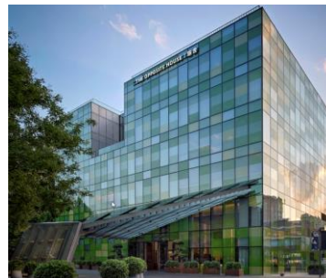
The Opposite House