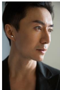
Artist- Huang Yiwei