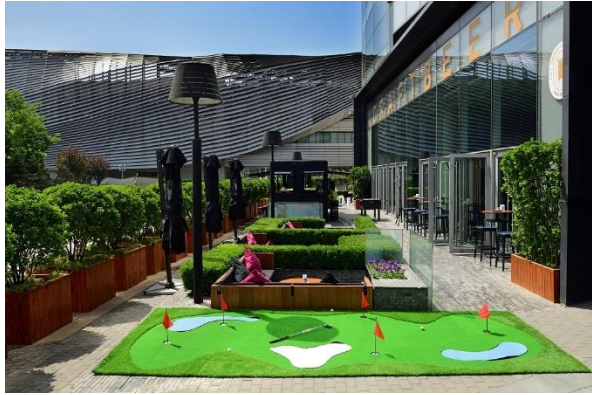
The Craft Container