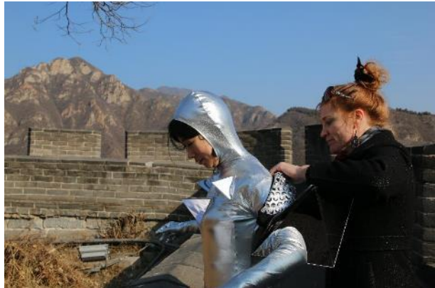
Filming of dancer at The Great Wall of China