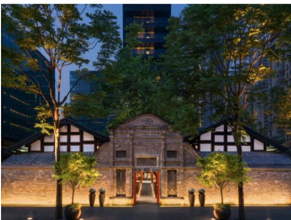
Exterior, The Temple House