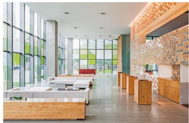
Living Room Day View, The Opposite House