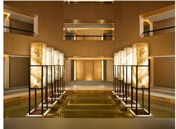
Atrium Pool, The Upper House