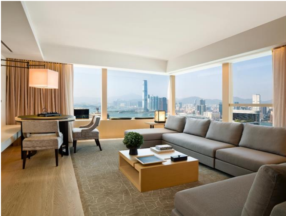
Upper Suite Living Room, The Upper House