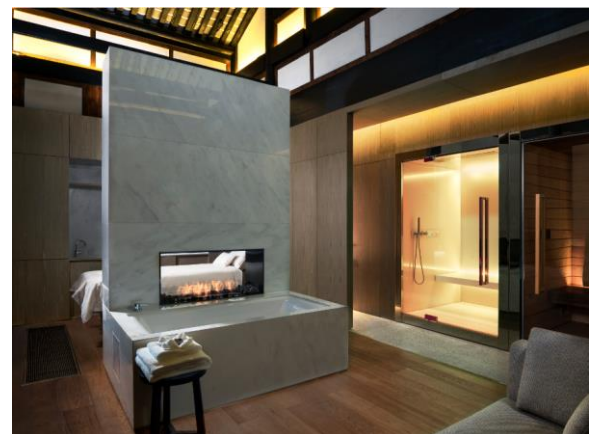
MIXUN Spa VIP Room, The Temple House