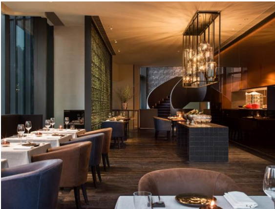
Sui Tang Li