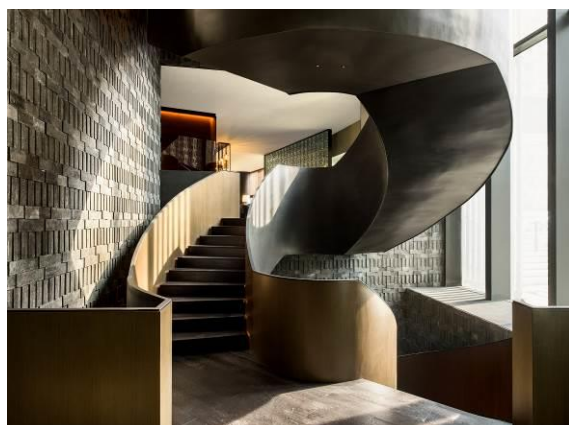
Oval Staircase, The Middle House Residences