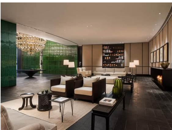
Lobby, The Middle House

To celebrate the opening, guests can reserve one night in a Studio 60 room at RMB 2,500 (subject to service charge and tax), including complimentary daily breakfast at Café Gray Deluxe for two. For more information, please visit: https://www.themiddlehousehotel.com/zh-cn/offers-and-gifts/opening-offer/