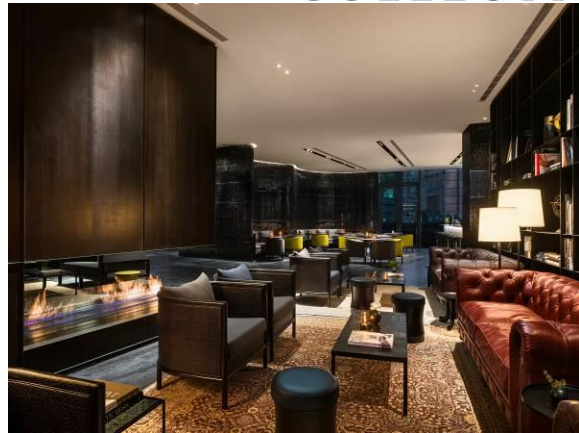
Café Gray Deluxe Lounge Area