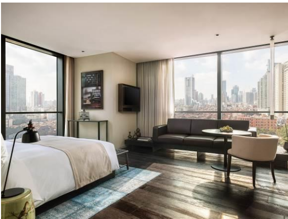
Studio 70, The Middle House