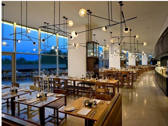
Feast (Food by EAST)