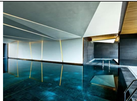
Beast (Body by EAST)