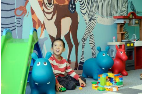
Kids' Corner in Feast (Food by EAST)