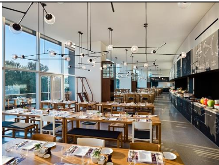
Feast (Food by EAST)