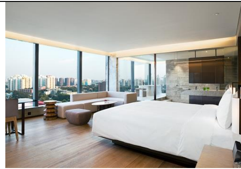
EAST, Beijing Studio Room