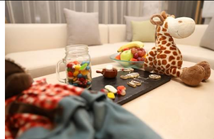
Kids Welcome Amenities