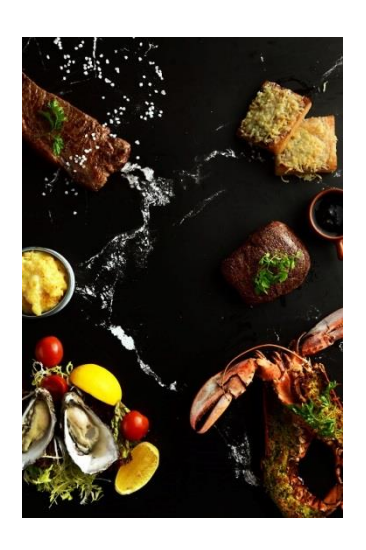
Surf & Turf Platter