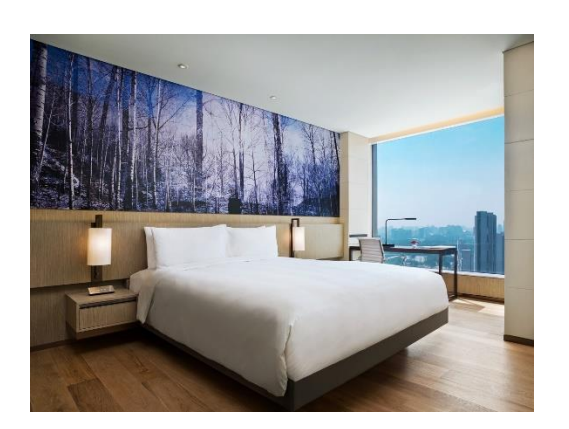
Urban View Room