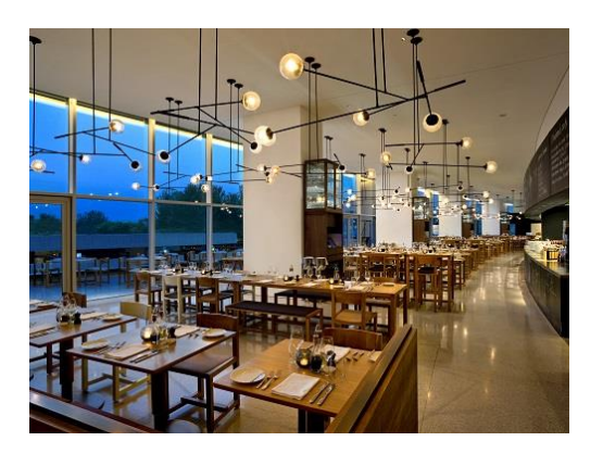
Feast (Food by EAST)