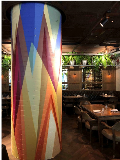
Ultra Waves by Pasha Wais