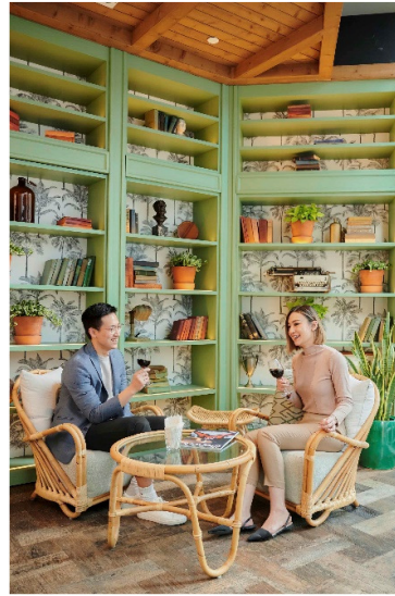
Second Floor Foyer