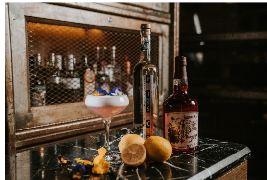
Thelma & Louise Sour