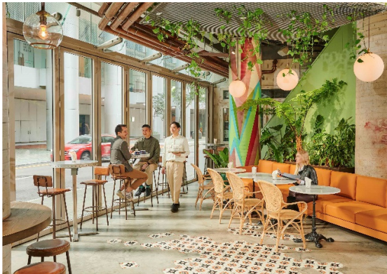
Ground Floor Dining Area