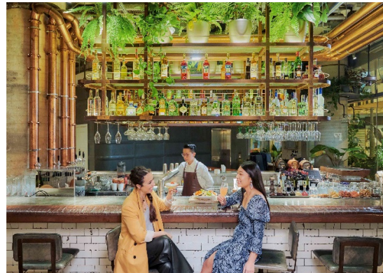
Ground Floor Bar