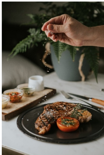
450g Dry-Aged Strip Steak