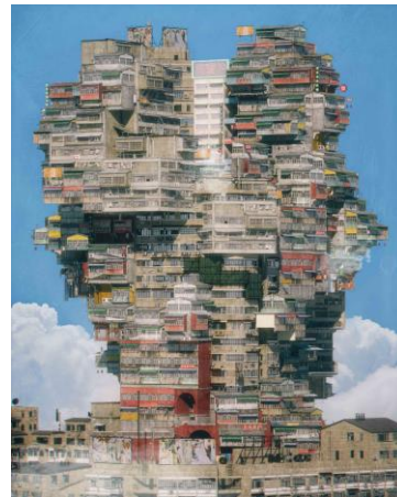
One Island South