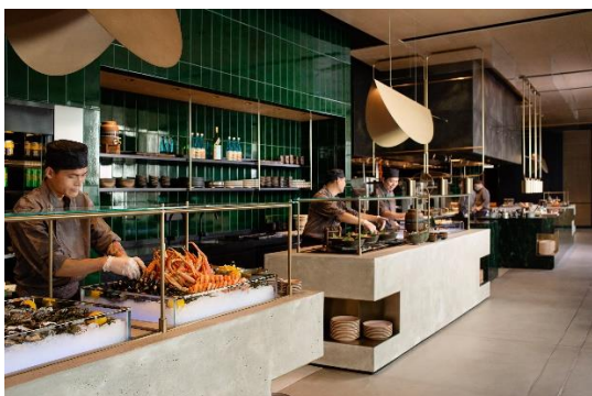
FEAST (Food by EAST) buffet counters