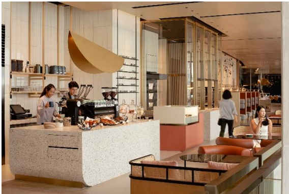
Domain, part café part co-working space on 1/F