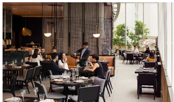
FEAST (Food by EAST), bustling eatery on 1/F