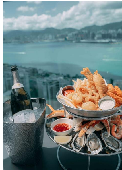
Fresh & Fried Seafood Platter with Sparkling Cloudy Bay Pelorus