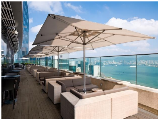
Sugar, rooftop bar and lounge on 32/F