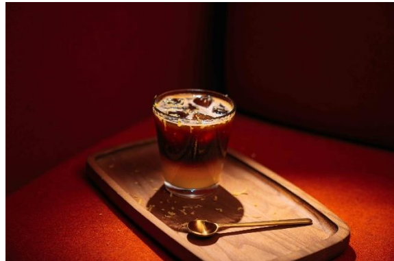
Seasonal coffee - Yuzu Espresso Tonic