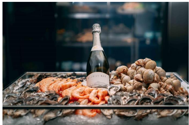
FEAST (Food by EAST) free-flow wine package