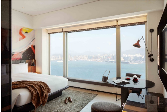
Harbour View Room