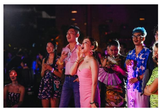
The Temple House 8th Anniversary Party