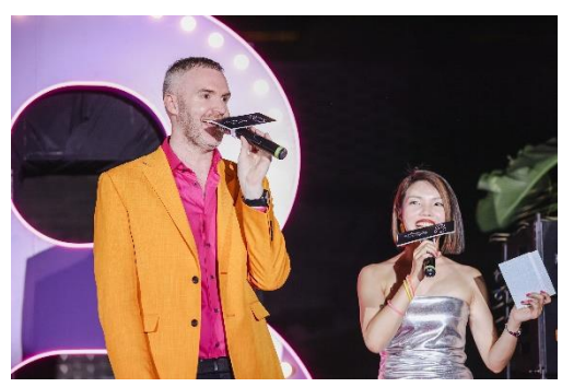
The Temple House 8th Anniversary Party