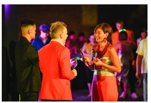
The Temple House 8th Anniversary Party