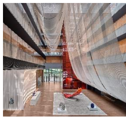
The Opposite House