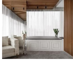
The Opposite House - The Harrods Residence Suite – Relaxation Zone