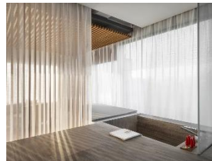
The Opposite House - The Harrods Residence Suite – Bathroom Area 2