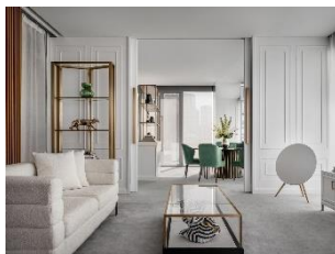
The Opposite House - The Harrods Residence Suite – Living Room 1