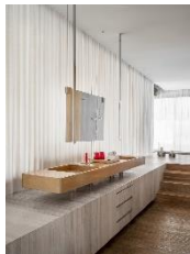
The Opposite House - The Harrods Residence Suite – Bathroom Area 1