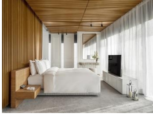
The Opposite House - The Harrods Residence Suite – Bedroom