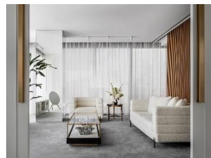
The Opposite House - The Harrods Residence Suite – Living Room 2