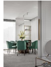
The Opposite House - The Harrods Residence Suite – Dining Room 2