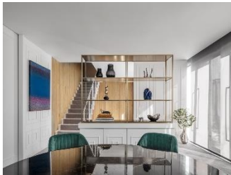
The Opposite House - The Harrods Residence Suite – Dining Room 1