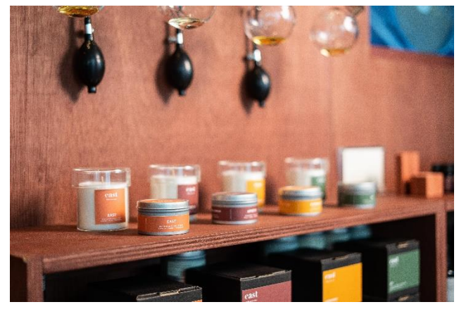
EAST's signature scents