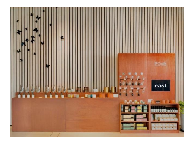
Domain x BeCandle pop-up