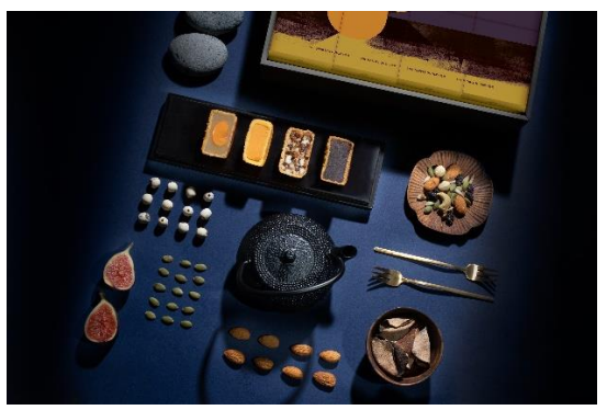
Eight mini mooncakes with four enticing flavours in each box