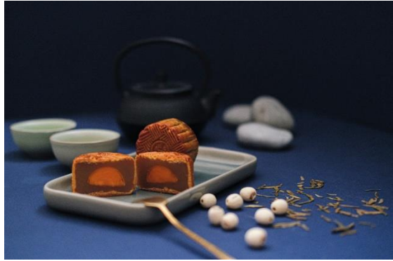
Maltitol White Lotus Seed Paste Mini Mooncake with Yolk