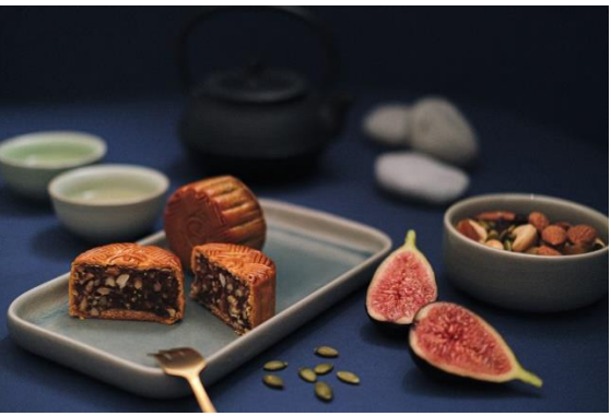
Assorted Nuts Mini Mooncake with Dried Figs