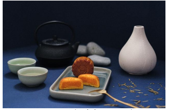
Egg Custard Mini Mooncake

For high resolution images, please click <u>here</u>.