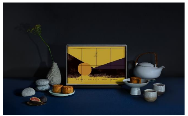
The House Collective mooncake set - stylish and sustainable packaging