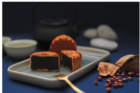
Red Bean Paste Mini Mooncake with Mandarin Peel