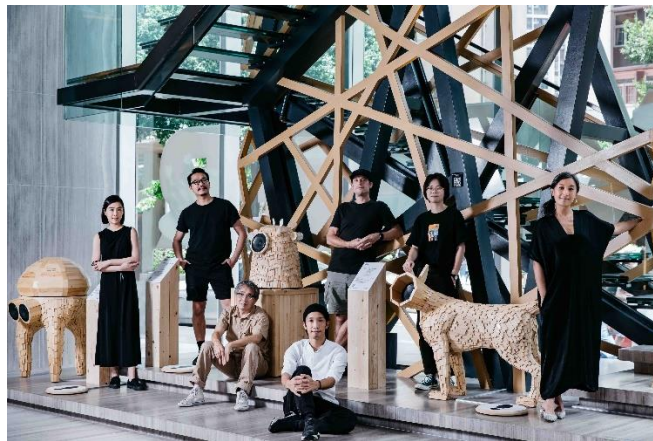
EAST Hong Kong is joining hands with local artists and designers to introduce Art at EAST: City Symphony