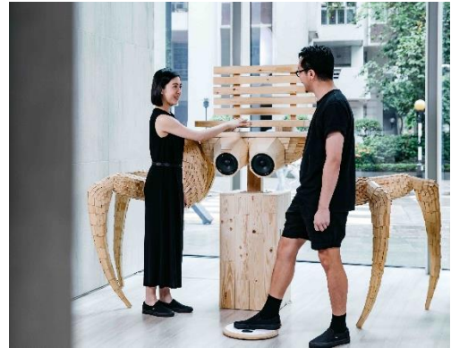
Mr. Bench – Tap the chair to activate