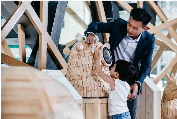
Lady Wild Card – Squeeze one of the ears to activate