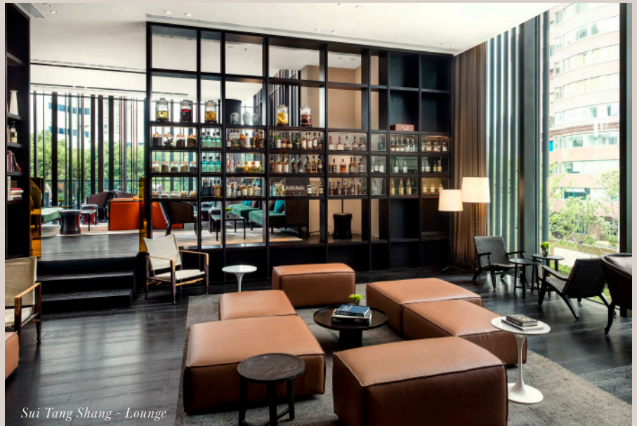
Sui Tang Shang - Lounge

This beautiful place sets the perfect mood for your pre or post dinner drinks.