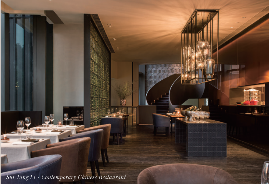
Sui Tang Li - Contemporary Chinese Restaurant