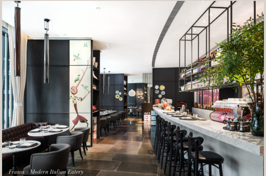
Frasca - Modern Italian Eatery

Say "buon appetito" at our modern Italian eatery, with ingredients sourced locally with the utmost care or imported from the finest appellations in Italy. Gather friends and family together for a fun, casual affair in the sun-lit space and accompany your meal with a curated selection of Italian vintages from our wine cellar, or sip an aperitivo al fresco amidst the seasonal blooms and greenery on our garden terrace.