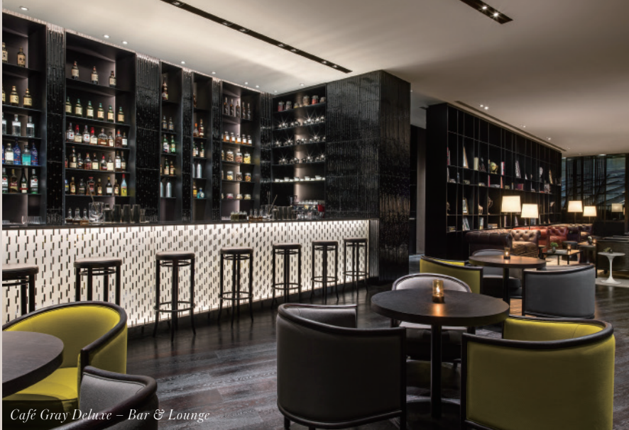
Café Gray Deluxe – Bar & Lounge

The Middle House offers a dynamic collection of contemporary restaurants, each stylishly designed by Lissoni Architettura. Like all The House Collective's eateries and bars, ours are not just for guests; they are destination dining in their own right.