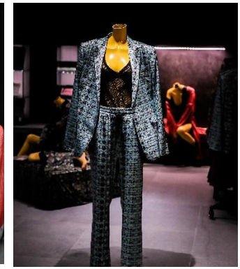
Dirty Pineapple Pop Up Store at The Middle House