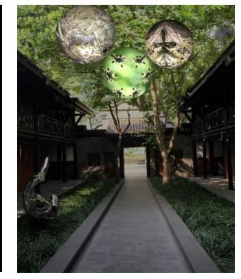
The Temple House, rendering of installation