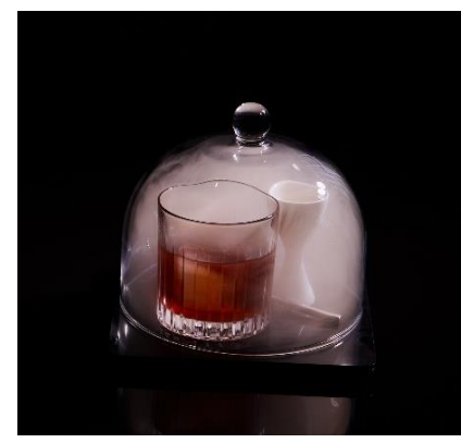
Her Favourite Boulevardier, fire element cocktail