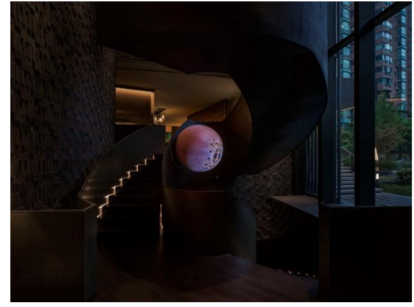
Fire element, Staircase of The Middle House