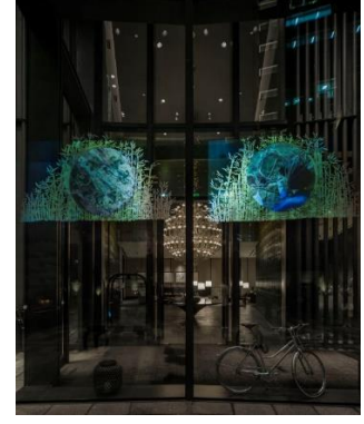
Wood element, Lobby Entrance of The Middle House