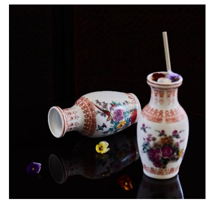
The Golden Buddha, water element cocktail