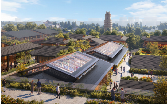
Artistic impression of Taikoo Li Xi'an