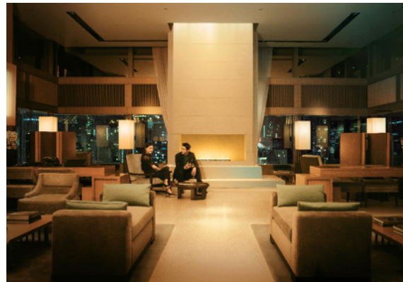
The Upper House Hong Kong