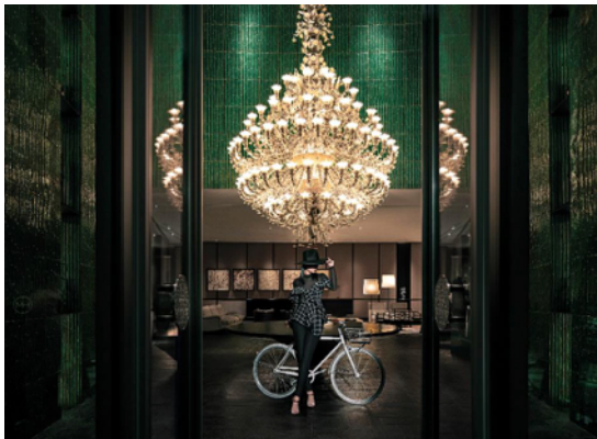
The Middle House Shanghai